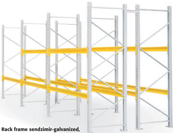
Rack frame sendzimir-galvanized, Standard colour crossbar light-grey RAL 7035